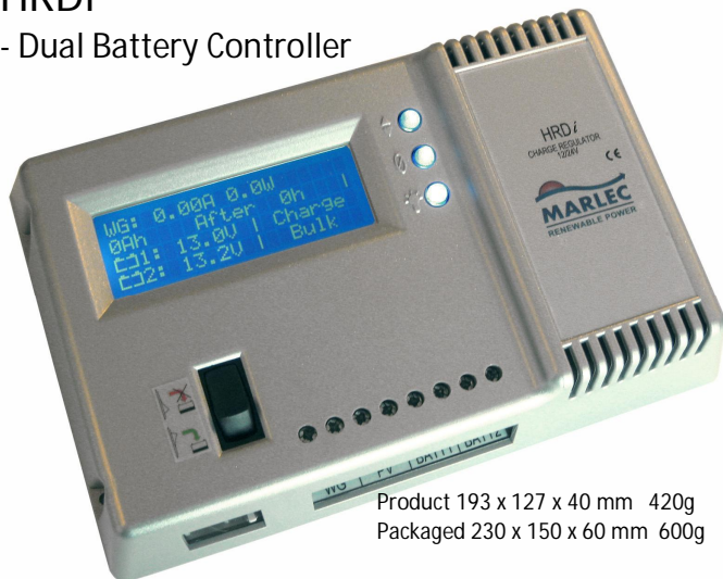
Product 193 x 127 x 40 mm 420g Packaged 230 x 150 x 60 mm 600g