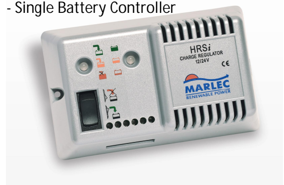
Product 130 x 80 x 42 mm 185g Packaged 160 x 110 x 60 mm 255 g